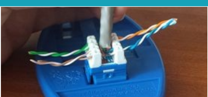
Make sure that twists are right up to termination points